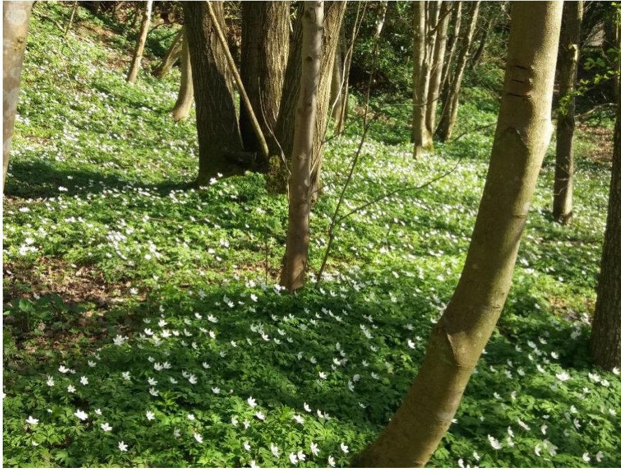
Wood anemones in Flatts Wood.