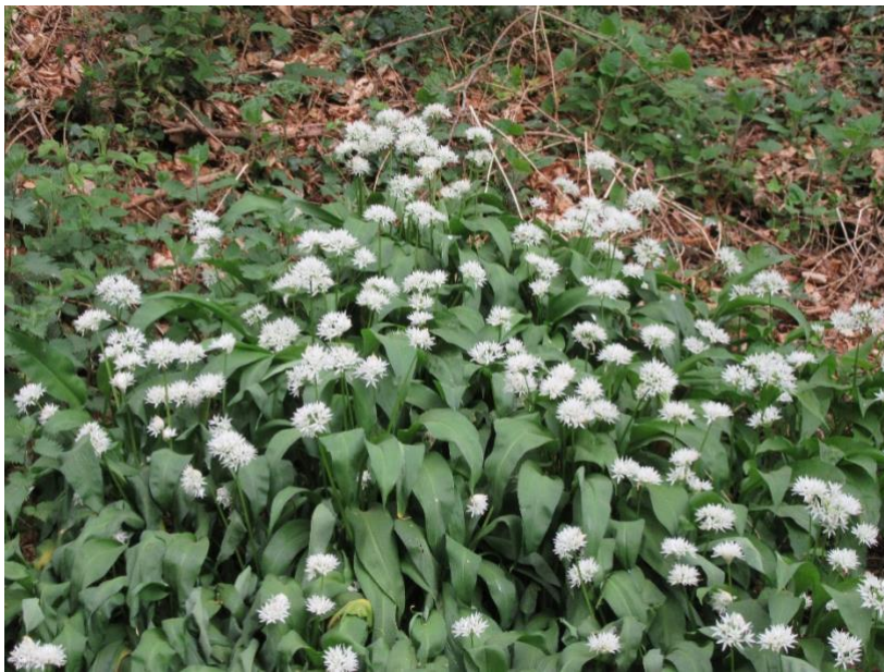
Wild Garlic in Flatts Wood.