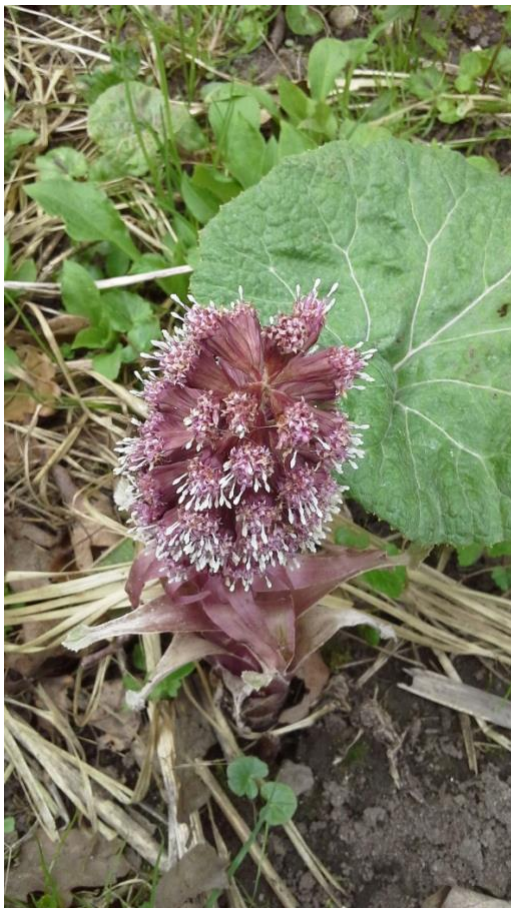
April 2020