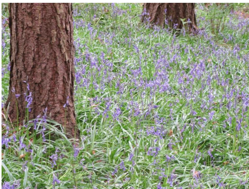
Bluebells in Flatts Wood.