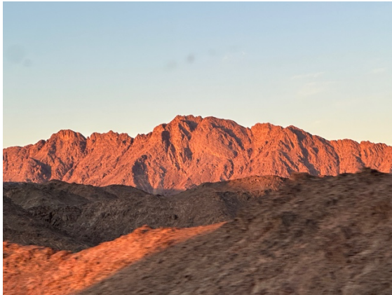
The Eastern Desert

For our March meeting we went further afield than usual. Tim Meacham presented an attempt to make historical sense of Ancient Egypt as represented by the sites and sights of a Nile cruise. Starting with a brief introduction to the unpromising geographical situation of Egypt (97% desert with most development confined to a thin strip running north to south along the Nile valley or along the Red Sea coast) it seemed an unlikely candidate to host the great civilisation which developed between 5000 BC and the Greek and Roman takeovers in the late 1 st century BC.