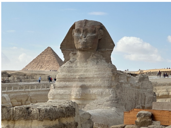
The Sphinx & Pyramid of Cheops at Giza

After early development, the 30 (or 31) dynasties of Ancient Egypt got going with Pharaoh Narmer who in about 3100 BC began to create what was to become a highly bureaucratic system of government in Upper Egypt (the southern half of the country as opposed to Lower Egypt in the north). Things then moved fast under Pharaoh Djoser who died in about 2640 BC but not before having a step pyramid built at Saqqara for his burial. A golden age followed with further social and architectural developments culminating in the two great pyramids at Giza (on the edge of modern Cairo). These formed the tombs of Pharaoh Cheops (also known as Khufu) finished in about 2560, and his son Khafre, who went one better by adding the Sphinx to guard the tombs.